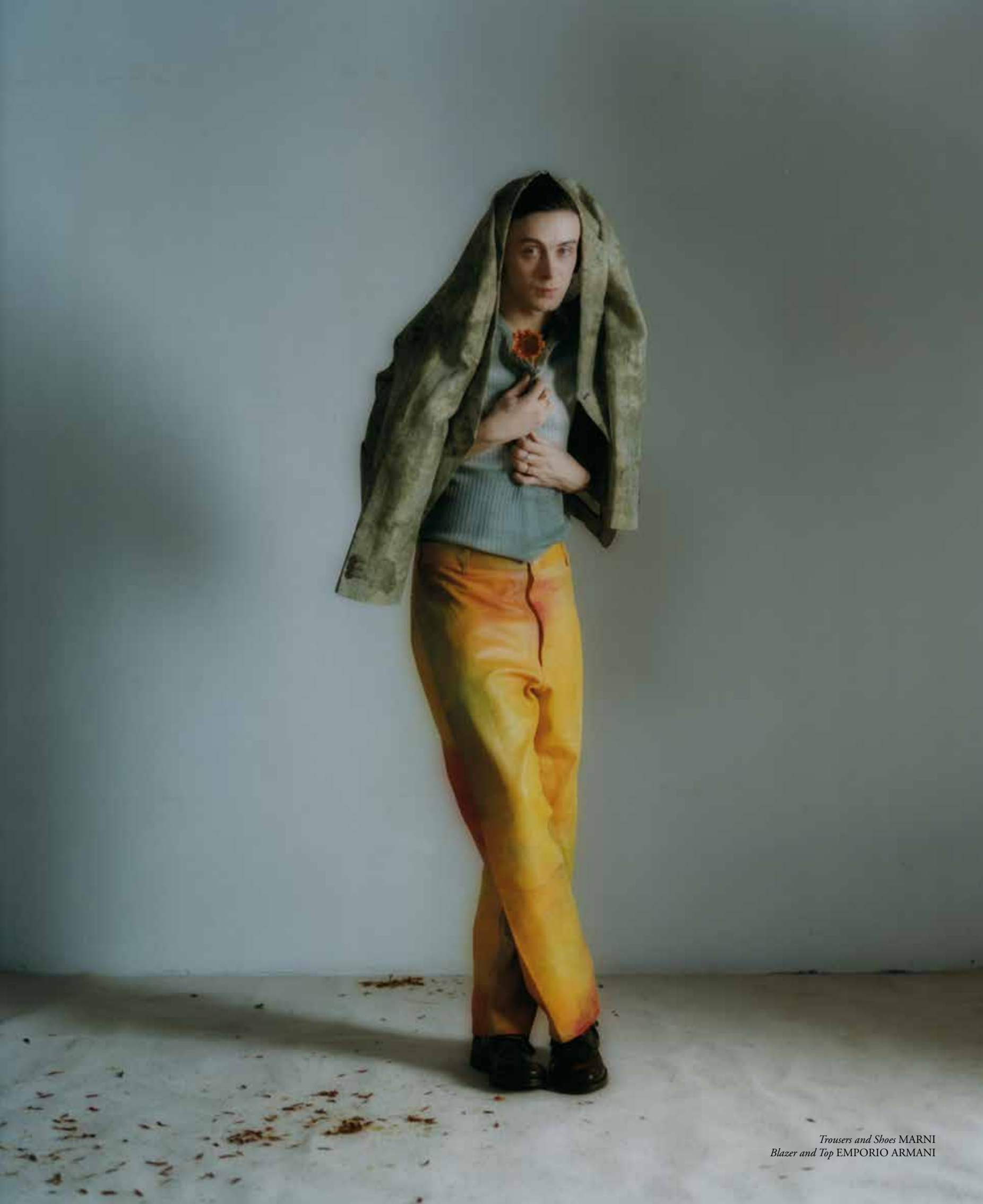
Trousers and Shoes MARNI Blazer and Top EMPORIO ARMANI