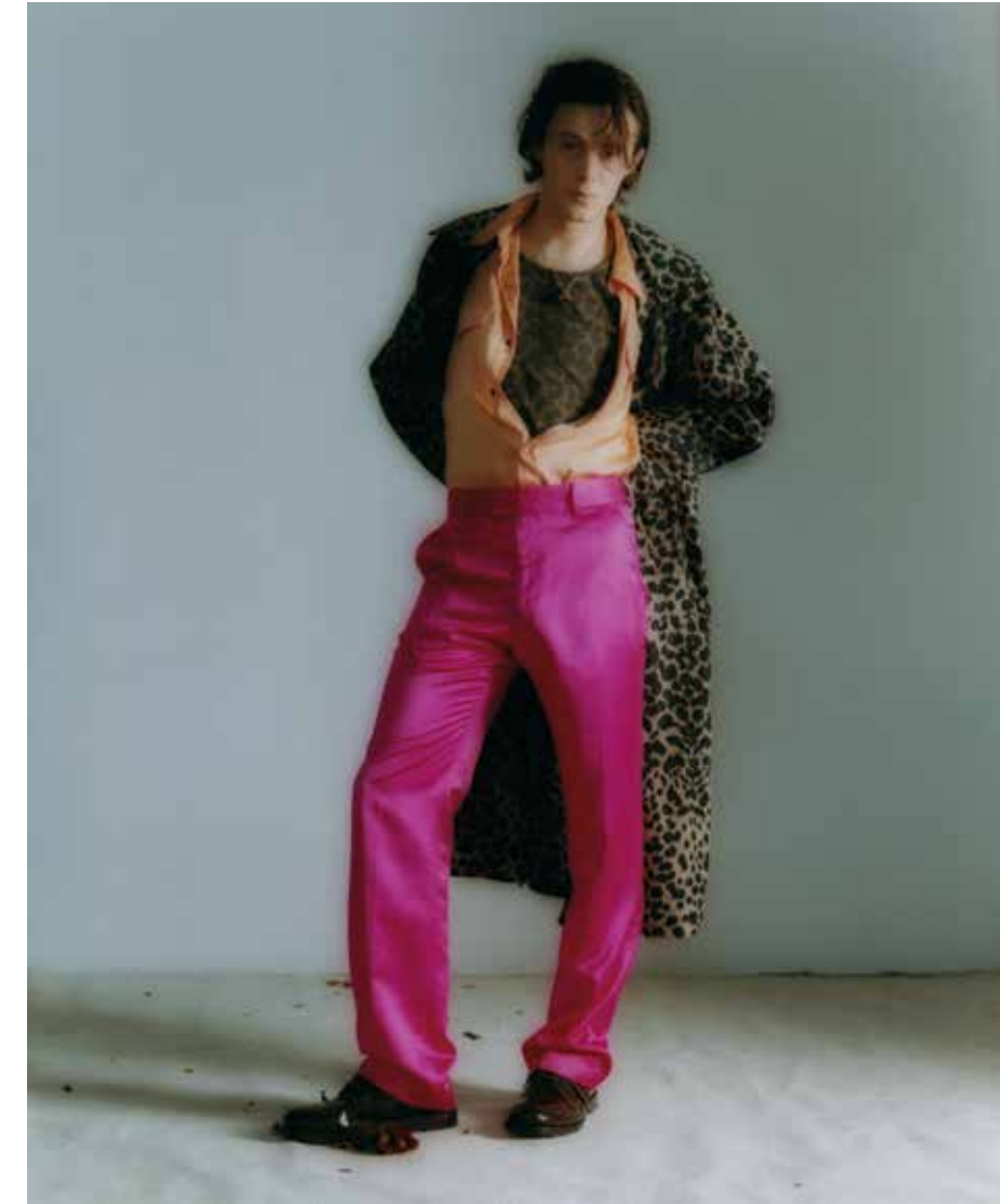
Shoes MARNI Tank top, Shirt, Coat and Trousers DRIES VAN NOTEN

feeling alone. And as long as I do that, it will always take on a pure form.