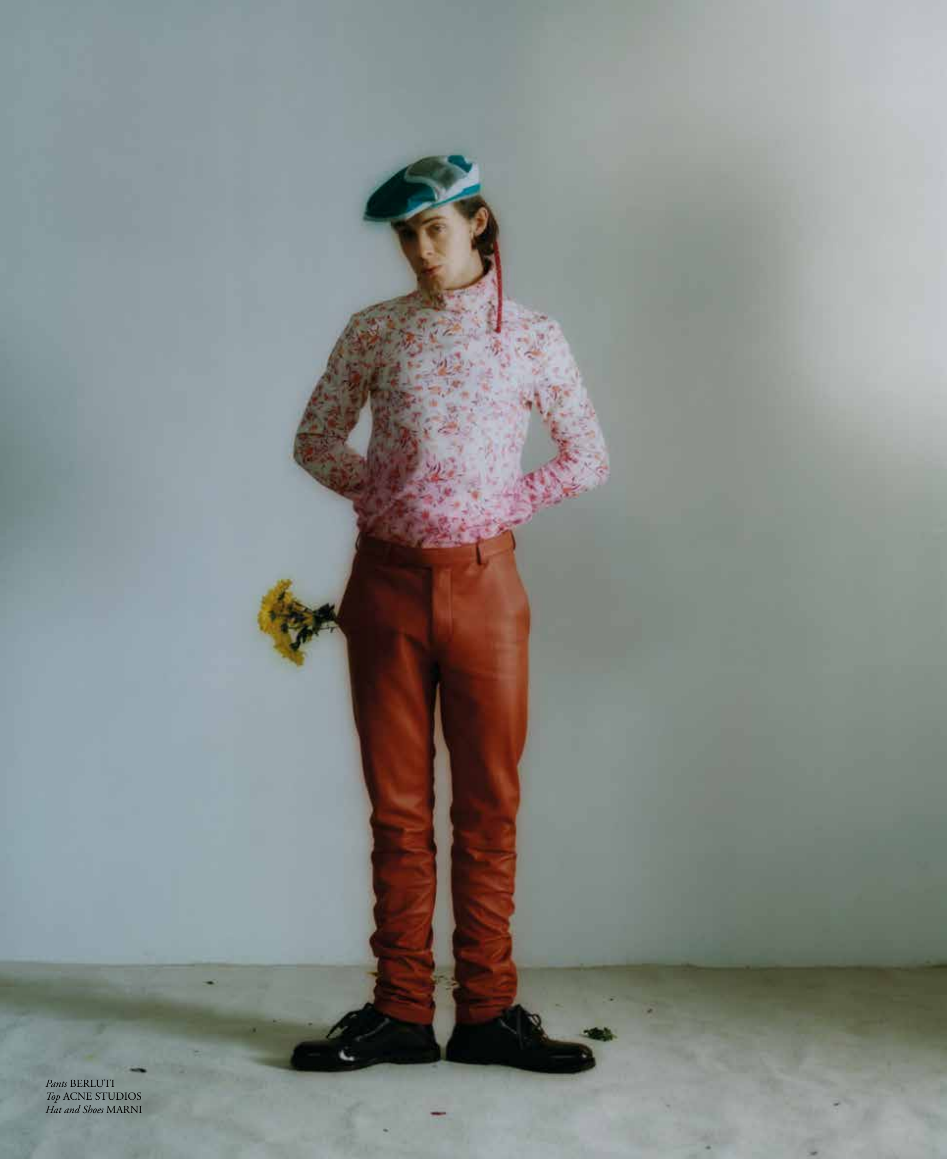
Pants BERLUTI Top ACNE STUDIOS Hat and Shoes MARNI