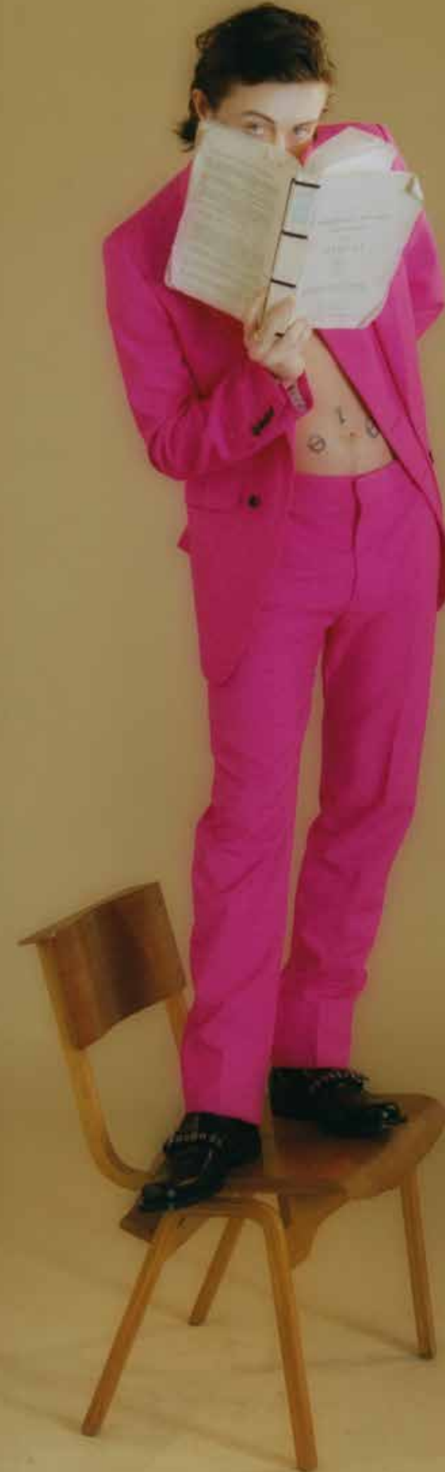
Loafers VERSACE Blazer and Trousers ALEXANDER McQUEEN