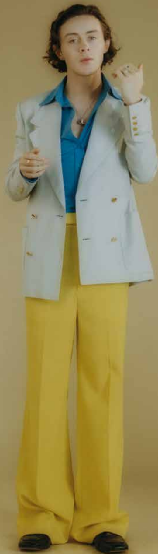
Total look GUCCI